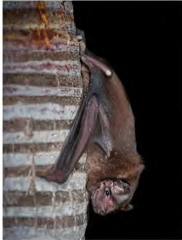
Figure 7. Photograph of Molossus molossus from swimming pool of the Kings Well Resort on the island of St. Eustatius. Note the short, rounded ears, nearly naked face, and chestnut-black coloration characteristic of this species. The tail that is free beyond the edge of the uropotagium, characteristic of all bats of the family Molossidae, is difficult to see between the feet of this individual.

Remarks. —This common “house bat” is widely distributed throughout the archipelago and was expected on St. Eustatius (Fig. 7). Koopman (1968) first reported specimens of this species from St. Eustatius without reference to specific specimens or localities. Husson (1962) restricted the type locality of M. molossus to the island of Martinique, which led Dolan (1989) based on morphometrics to apply the name M. m. molossus to this species throughout the Lesser Antilles. Lindsey and Ammerman (2016) included specimens